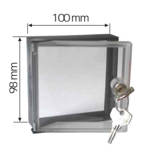
STD-99 transparent IP 54 door with lock for 96 x 96 mm case