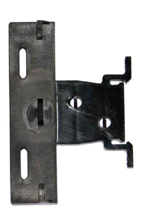
SRH-99 TS-35 DIN rail brackets for 96 x 96 mm case