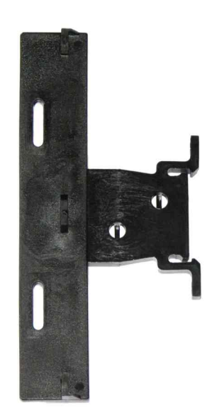
SRH-141 TS-35 DIN rail brackets for 144 x 144 mm case