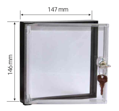
STD-141 transparent IP 54 door with lock for 144 x 144 mm case

Transparent door with moulded frame acc. to DIN 43700, lockable with security key. Door and frame are made by injection moulding thus assuring an exact fit, an optimal choice of a material which is very strong and with no risk of corrosion; perfect seal-protective system IP 54 provided by all-round soft rubber sealing the moulding; door does not swingin or out sideways on opening; door-frame and frontframe can be exchanged.